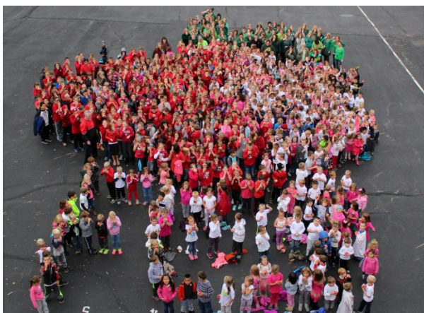
Freedom Elementary School participated in the Great Apple Crunch day on October 13.