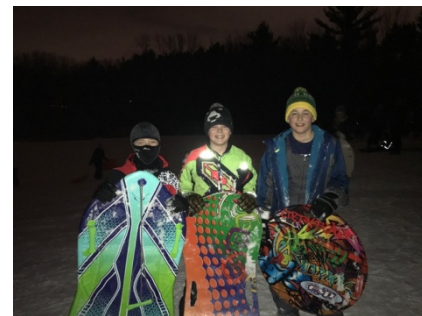
Mother/Son Sledding Event at Plamann Park.