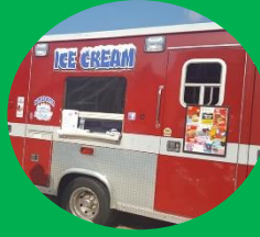
Ice Cold Emergency Truck facebook.com/ICEtruck4u