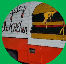
The Lil Juicy Burger Co facebook.com/TheLilJuicy