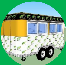
Gourmet Corn Yucatan facebook.com/GourmetCornWI