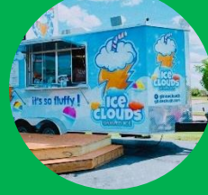
Green Bay Ice Clouds facebook.com/GBIceClouds