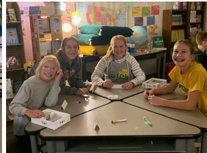
Students enjoying some word games during Irish Hour.